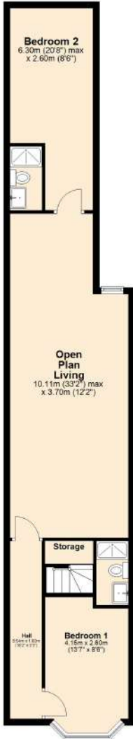
Ground Floor Approx. 71.1 sq. metres (765.2 sq. feet)